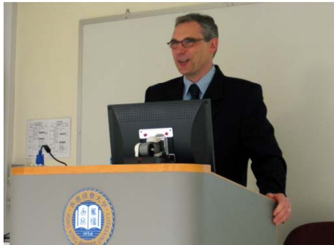
Dr. Paul Crowe of Simon Fraser University is a long-term friend of LEWI

Through the late 1980s and 1990s, a dramatic increase in migration to Canada from Hong Kong, and then the People's Republic of China, eclipsed Europe as the major source of migration; Canada's west coast was a favoured destination. A steadily increasing population of new Canadians of Chinese heritage in Vancouver and surrounding suburbs, facilitated by liberalization of Canada's immigration policy and official enshrining of multiculturalism, has brought a dramatic shift in demographics that has made possible an efflorescence of Chinese religious institutions. Religion can play a major role in mediating the process of adaptation to a new cultural context and, alternatively, in shoring up one's identity in the face of demands for integration. Research into religious communities in Canada with Chinese cultural origins can provide valuable insights into the experiences of new Canadians and the social and political dynamics linked to those experiences. This seminar will provide an overview of some of the work Dr. Crowe is doing in relation to Chinese religious communities in British Columbia.