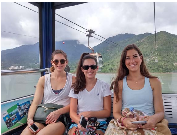
SMU students riding cable car in Ngong Ping during the Tai O eco tour on 30 Jun 2016